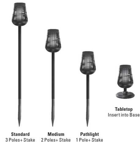
Standard 3 Poles+ Stake