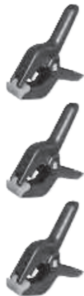
3X Holding Clamps