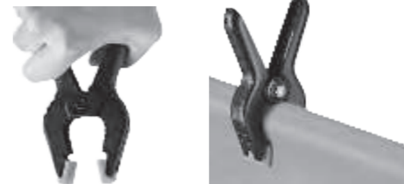
Three rugged clamps with reinforced springs grasp the backdrop with extra strength.