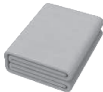
Polyester 5' x 7' Chroma-Key Backdrop