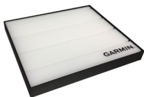
SMALL TRAY SKU: M00-00527-00 Size: 7" W x 6" D