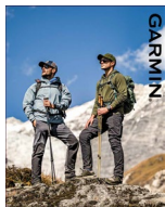
GRAPHIC FOR TRAY KIT SKU: M00-00941-04 Size: 7" W X 9" H

This display is great for small spaces and should be used inside a glass case. Displays up to 2 Garmin dummy units on each tray kit. For larger product assortments, tray kits may be merchandised side by side. Use with dummy units, small product cards, common features product cards, graphic back panels and trays, all ordered separately.