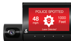
Shared Radar & Laser Alerts