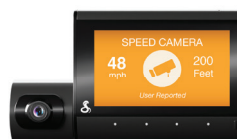
Red Light & Speed Cameras