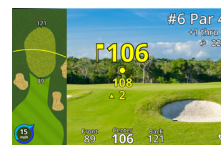
As seen through Z82 viewfinder