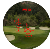
As seen through Z30 viewfinder