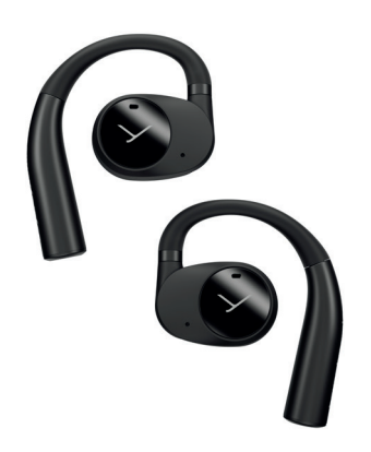
VERIO 200 black