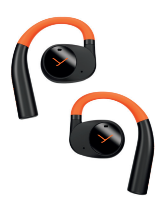
VERIO 200 SPORT