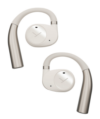
VERIO 200 cream